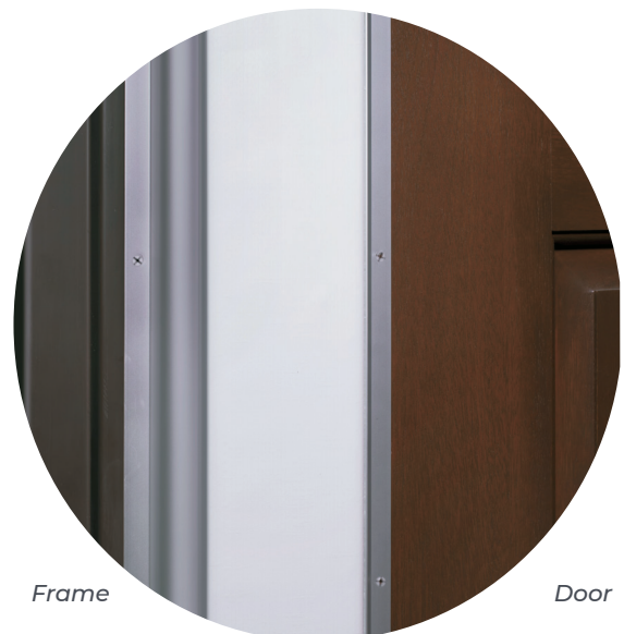
Door Shown in Open Position