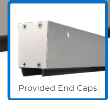
Provided End Caps