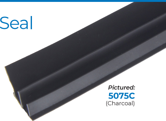
Pictured: 5075C (Charcoal)