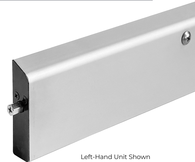
Left-Hand Unit Shown