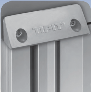
TIPIT® LG for use on full surface and half surface hinges. Specify (TIPIT LG)

For use in Hospitals, Behavioral Health, Correctional Facilities, and other Institutions